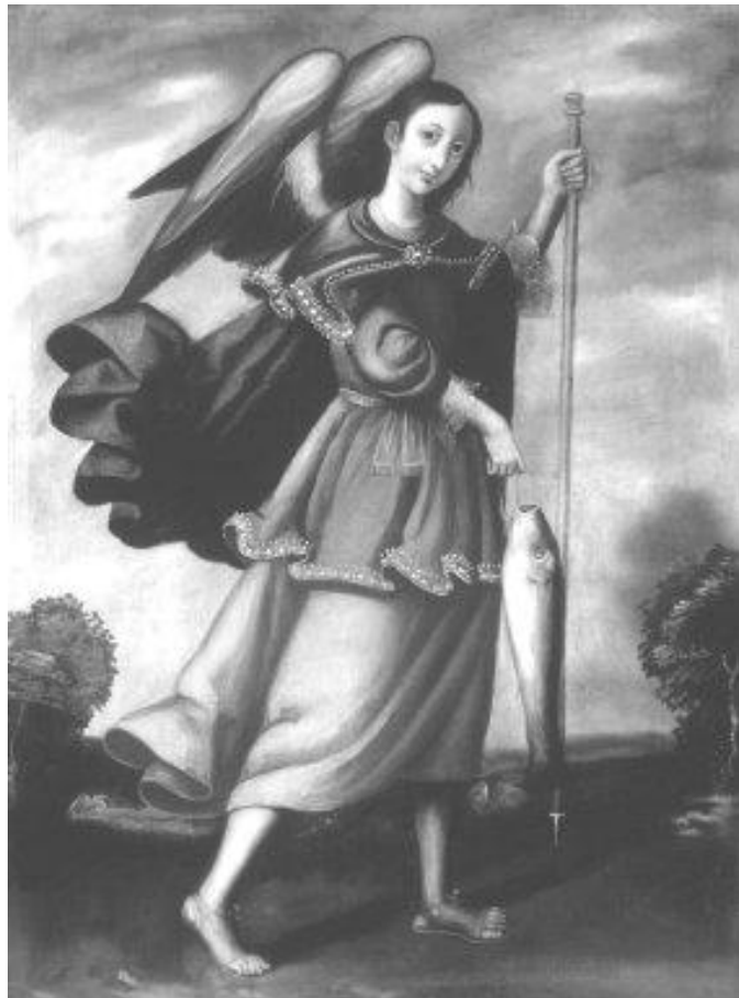
Archangel Raphael, Peru, 17 th century, Brooklyn Museum