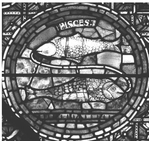
Pisces - Stained Glass Window at Chartres Cathedral

This is also our Christmas Party. Beverages will be supplied. Please bring finger food to share if you can. Everyone Welcome!